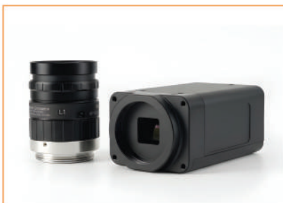
Embedded Vision Camera